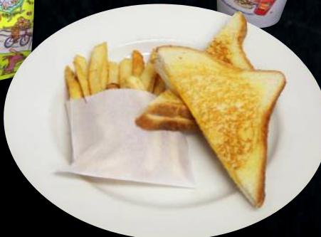
Grilled Cheese Kids Meal