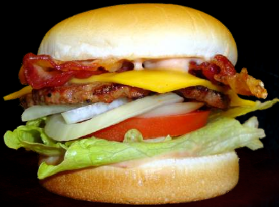
Jr. Bacon Cheeseburger